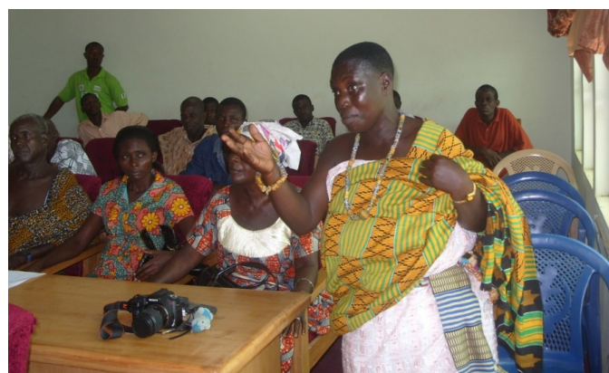
A Queen Mother (traditional community leader) makes a point during an awareness raising meeting.

In general, the lack of regular, proactive publication of information online and through local offices and media seriously limits transparency and accountability. Just making information available on request is inadequate in practice. Key documents such as forest management plans and maps may not be accessed, which limits the ability of people to know where and when legal timber production activities are happening. Currently, there is insufficient published information to monitor the legality of timber products. More positively, the FC reported that a committee is in the process of re-constructing its website so that more information is made available. This is a potential advance and an opportunity for civil society and NGOs to play a greater role in synthesising, analysing and disseminating key information.