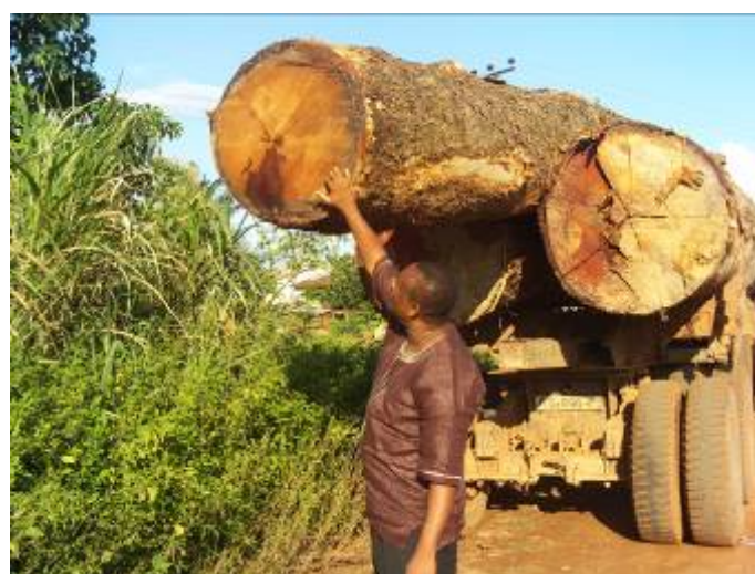
Unmarked logs waiting to be transported.

The list of indicators was drawn up by carefully studying the text of the VPA and then consulting key stakeholders in FC departments and civil society organisations on them. The investigator then assessed what information exists and is publicly available on each one by desk research and searches of the websites of the FC, the Environmental Protection Agency and international resources such as www.loggingoff.info . Key stakeholders from FC departments (including the FSD, TVD, TIDD, and RMSC) and civil society organisations provided further details and feedback on what information is available and how it can be accessed. Data were collected in June 2012 with further consultation and validation through July 2012.